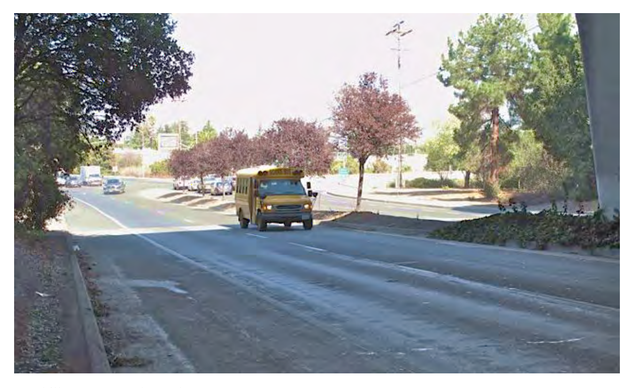
Foothill Expressway beneath Interstate 280.