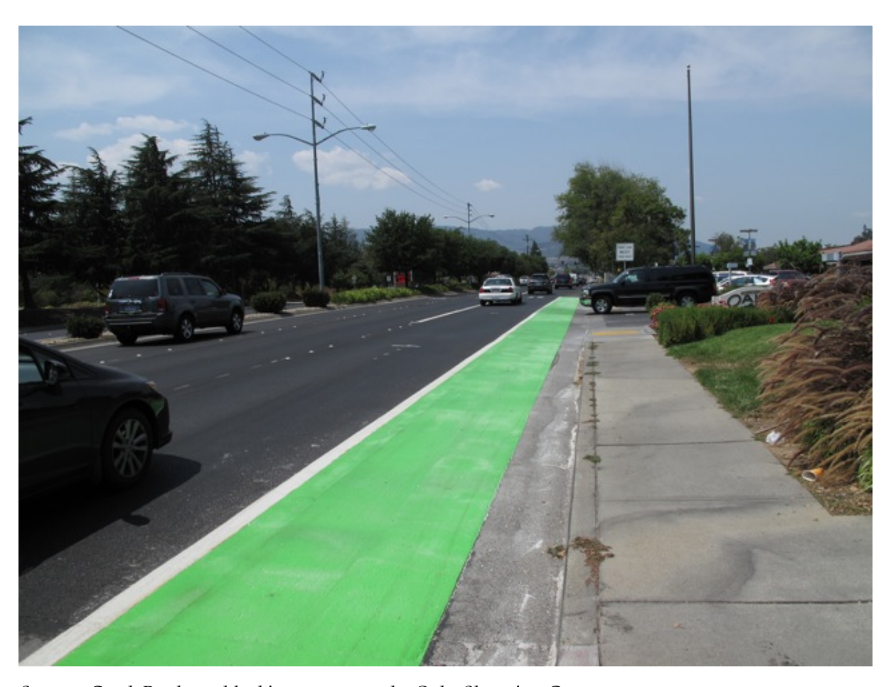
Stevens Creek Boulevard looking west past the Oaks Shopping Center.

Sidewalks are designated walking spaces along roadways. Sidewalks may be directly adjacent to the roadway curb or may include a planting strip that provides buffer to the roadway and an opportunity for street trees and landscaping.