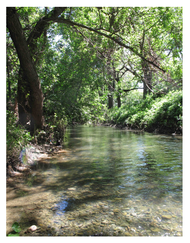
Stevens Creek in Mountain View.

The feasibility study is the first step in a trail planning process. The next step would involve the development of a trail master plan, which would be evaluated under the California Environmental Quality Act (CEQA). All future trail planning and environmental review will provide opportunities for public involvement.