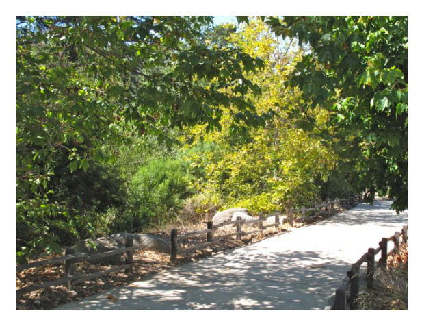
Stevens Creek Trail through Cupertino.

Construction of the trail should include geomorphic enhancements within the stream corridor to support passage of aquatic species and installation of locally native riparian and upland plants to increase habitat complexity for wildlife. These natural resource investments will create an inviting place in which to recreate and commute on foot and by bicycle and provide an opportunity to experience a little of the natural world within the heavily urbanized Bay Area.