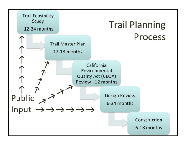
Figure 7 – Trail Planning Process.

A feasibility study is the first step in the trail planning process. A trail master plan, with a narrower range of potential trail routes, is then undertaken to more fully develop the alignments. The trail feasibility findings will provide significant background documentation for a trail master plan. A trail master plan process would provide additional opportunities for public input. Ultimately, a trail master plan must be evaluated under the California Environmental Quality Act (CEQA) prior to adoption by governing agencies. All of these trail planning and environmental review efforts will provide opportunities for further public involvement in shaping the future of the Stevens Creek Trail (See Figure 7 – Trail Planning Process).