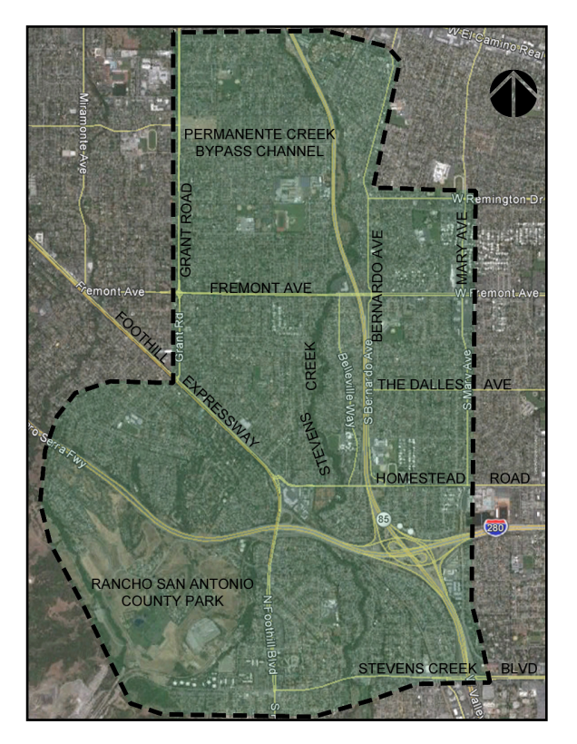
Map 1 - Regional Setting Map